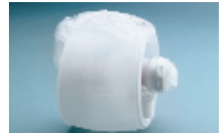
Folds for easy storage.