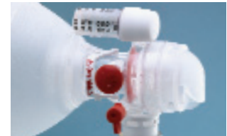
Disposable manometer permits visual control of lung pressure (pediatric and infant versions).