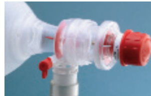
Direct PEEP connection for easy attachment.