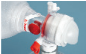
Pressure-limiting valve helps prevent overpressure in the lungs (pediatric and infant versions).

The incorporated handle and SafeGrip™ technology contributes even further to overall comfort, especially during prolonged critical events.